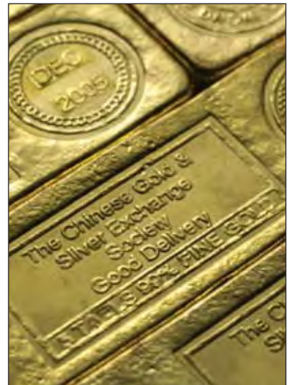
Hong Kong Good Delivery 5 tael bars are stamped by the CGSE.

According to CGSE records, more than 5 million good delivery 5 tael bars have been manufactured since 1967. This excludes the millions of non-good delivery 5 tael bars that have also been manufactured in Hong Kong since that time.