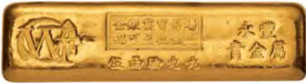
Obverse Wing Fung