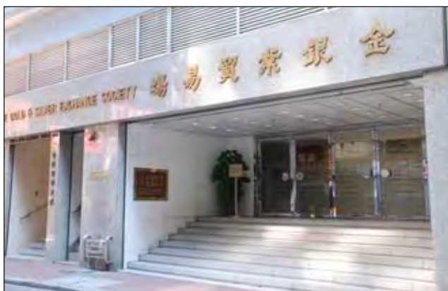
The CGSE has been based in Mercer Street, Hong Kong since 1927.