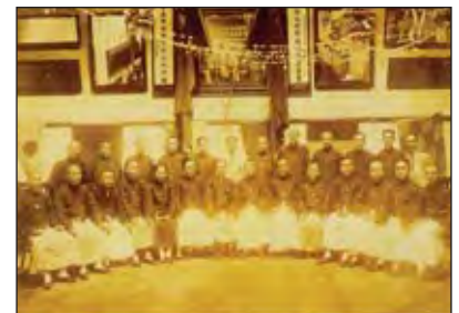
Historical photographs associated with the CGSE.