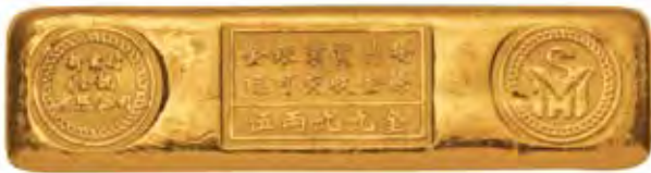
Sun Yip Hong