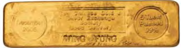
Reverse Wing Fung