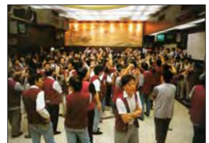
The trading hall of the CGSE in the 1980s.